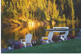
Summertime living in Fernan Lake Village

Permits are required for all fences and all accessory structures such as storage sheds. Contact Cheri at 208-640-9530.