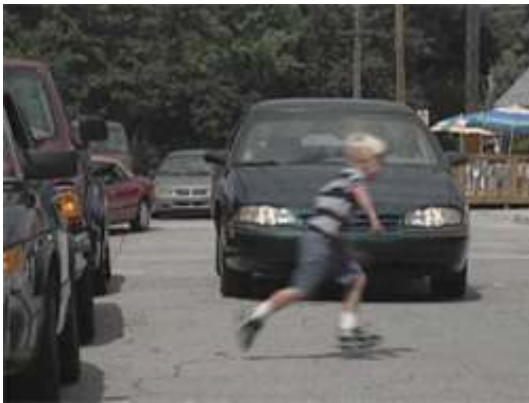
Please do not park cars on the street

PLEASE KEEP ALL VEHICLES PARKED IN YOUR DRIVE WAY. Parked cars on the street make it difficult for our street cleaners to clean the streets properly and create an added danger for children and animals. We have had complaints from residents and your cooperation would be greatly appreciated by all. With summers arrival, and added outdoor activity this is especially important for safety within our Village.