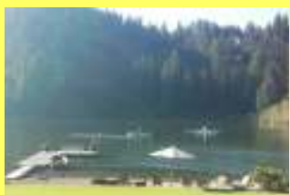
Crew Boats on Lake Fernan