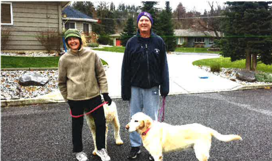
FERNAN LAKE VILLAGE