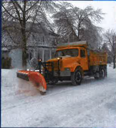
KEEP STREETS CLEARED FOR SNOW PLOWS