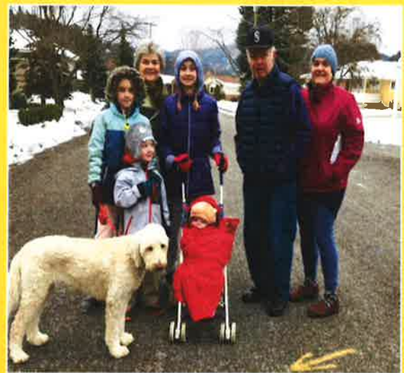
The Marano Clan out for a brisk winter walk