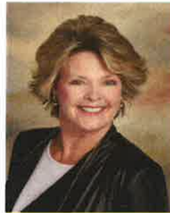
MAYOR HEIDI ACUFF

With the last glimpse of “Old Man Winter” behind us it is time we prepare for a beautiful Spring and summer ahead. We will have a SPRING